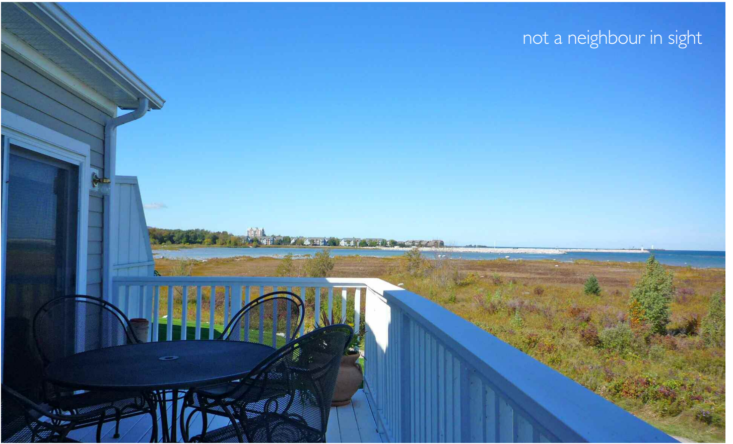
not a neighbour in sight